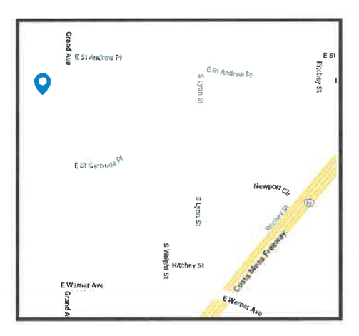
Santa Ana Regional Center 1928 S. Grand Avenue, Bldg. B Santa Ana, CA 92705