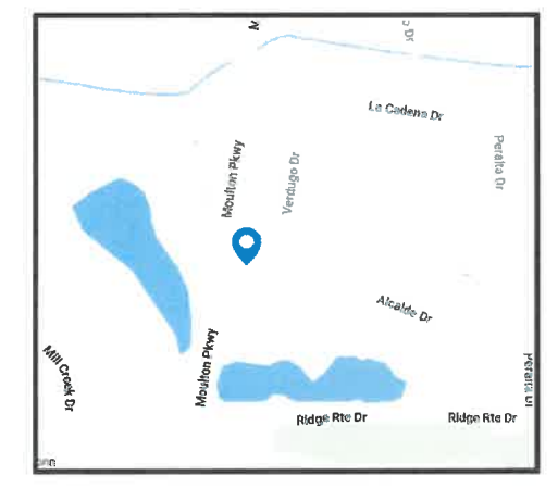
Laguna Hills Regional Center 23330 Moulton Parkway Laguna Hills, CA 92653