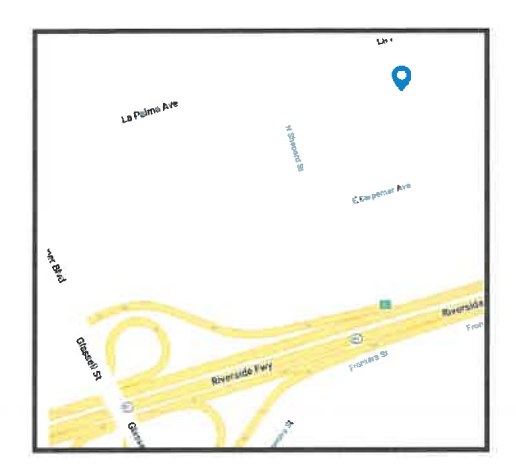
Anaheim Regional Center 3320 E. La Palma Avenue Anaheim, CA 92806