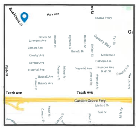
Garden Grove Regional Center 12912 Brookhurst Street Garden Grove, CA 92840