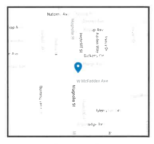
County Community Service Center 15496 Magnolia St. Westminster, CA 92683