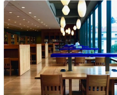
Resource Library and FAQs